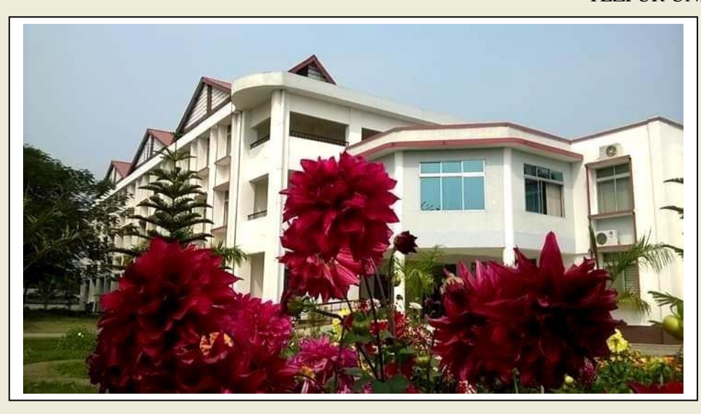
SCHOOL OF ENGINEERING, TEZPUR UNIVERSITY