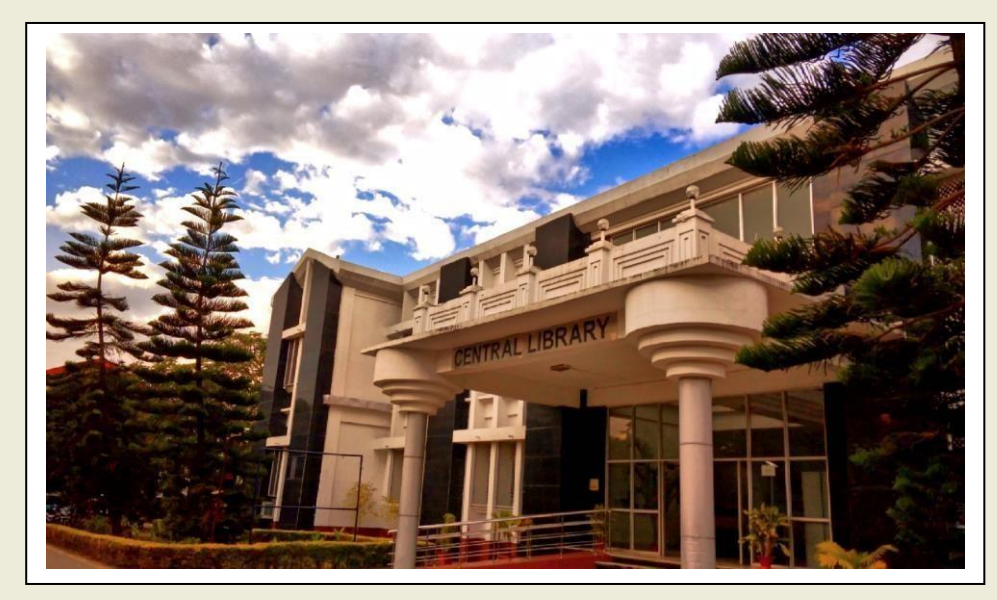
CENTRAL LIBRARY, TEZPUR UNIVERSITY