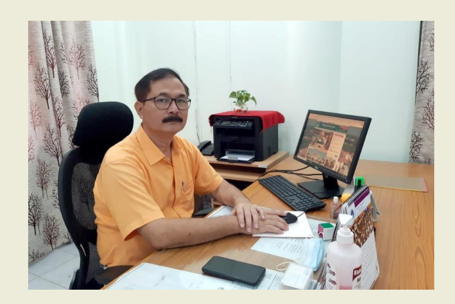
FOREWORD FROM THE DIRECTOR

The distance and online mode of education is being perceived as the future system of education worldwide. The ongoing trends, particularly those triggered by the COVID-19 pandemic, hint at a paradigm shift in the pattern of education from a conventional class room or face-to-face teaching and learning system to a distance and online mode. In line with these trends, the Govt. of India is also taking up measures to prefer the distance and online mode of education that is clearly reflected in the directives from the Ministry of Home Affairs dated September 30, 2020, which states that, "Online/distance learning shall continue to be the preferred mode of teaching and shall be encouraged". Under these changing circumstances, the institutions offering distance and online academic programmes need to gear up for greater responsibilities.